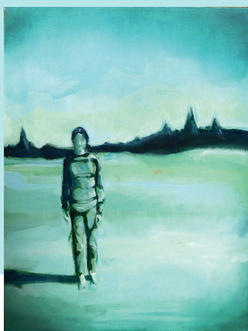
(Upper Left) Boardwalk, (Bottom Left) Mother, (Right) Moustahe