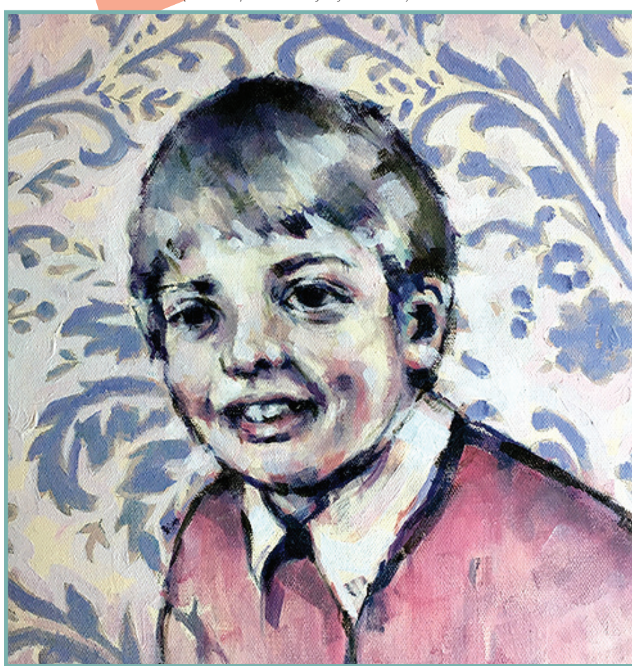
Garage Magazine | 7