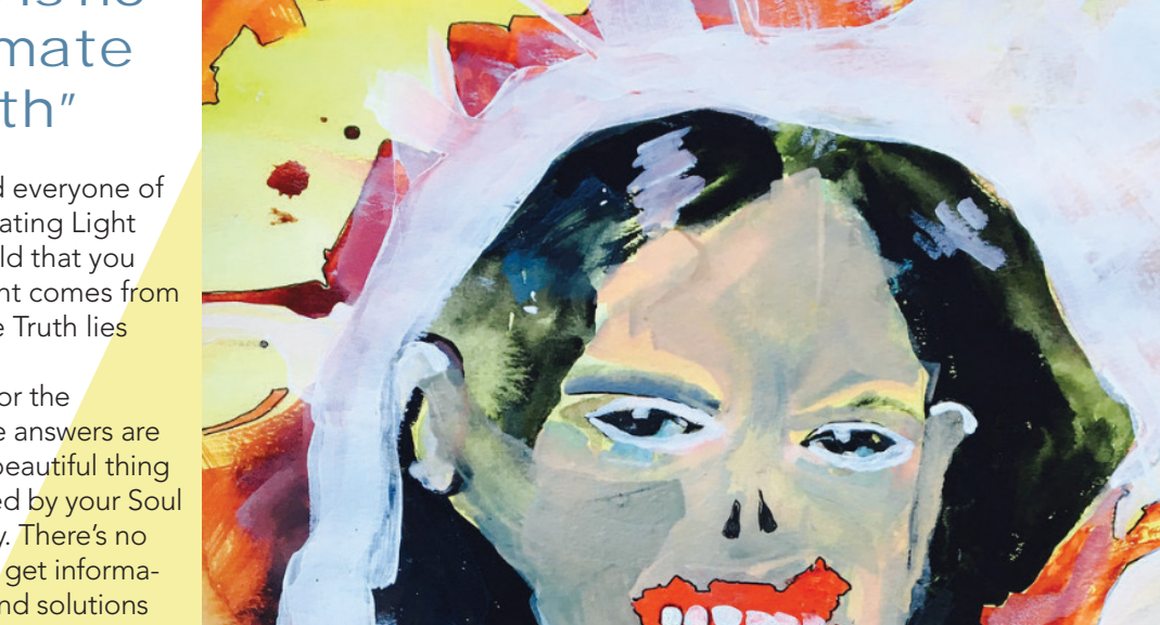
Woman in Blue

guiding their lives as you are learning to trust your Soul to guide your life. In the meantime, not holding that judgmental place, as if you have the crystal ball into their Soul, knowing that they're making the wrong decisions.